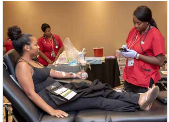
NBNA and American Red Cross Sponsor Blood Drive at the 2018 NBNA Conference, St. Louis, MO