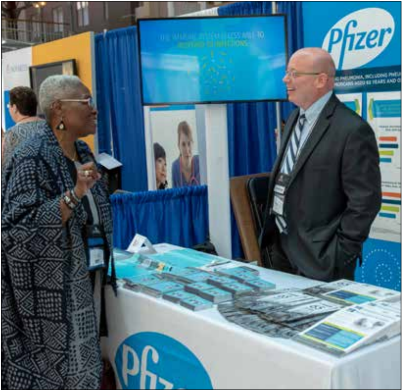
Exhibitor - Pfizer, Inc.