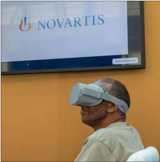
Exhibitor - Novartis