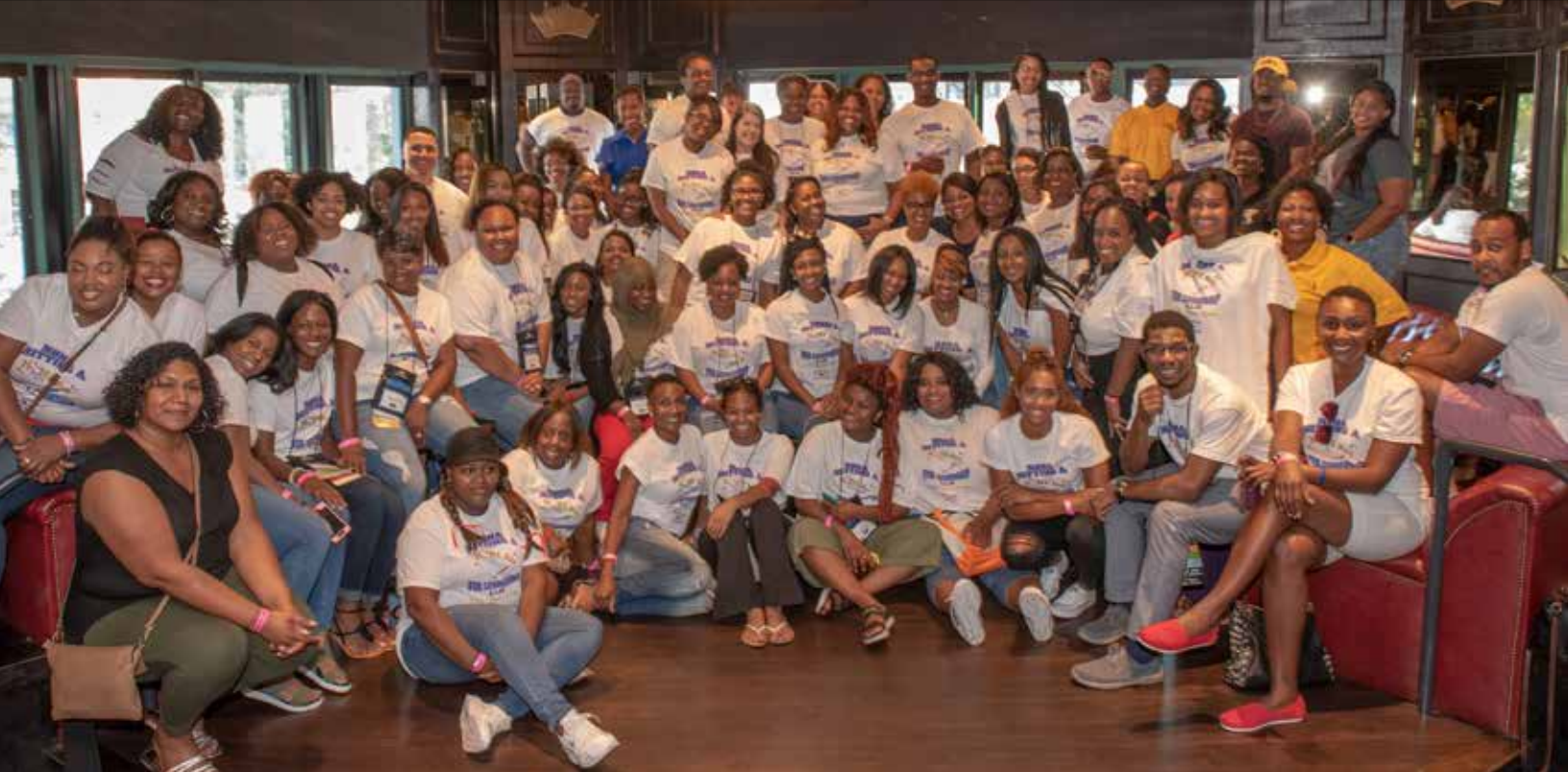
NBNA 40 and Under Forum hosted by VITAS Healthcare