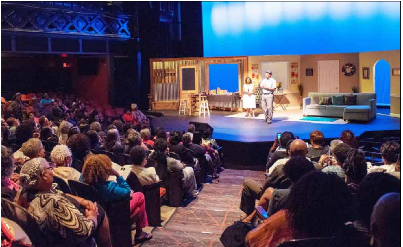
Forget Me Not Play sponsored by African Americans Against Alzheimer's