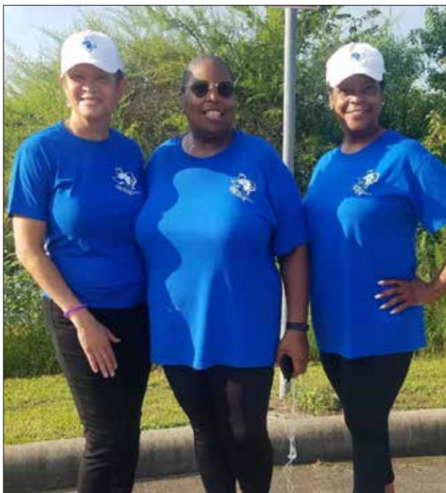
Fort Bend County Black Nurses Association