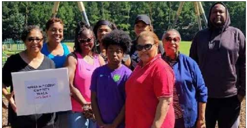
Central Carolina Council of Black Nurses