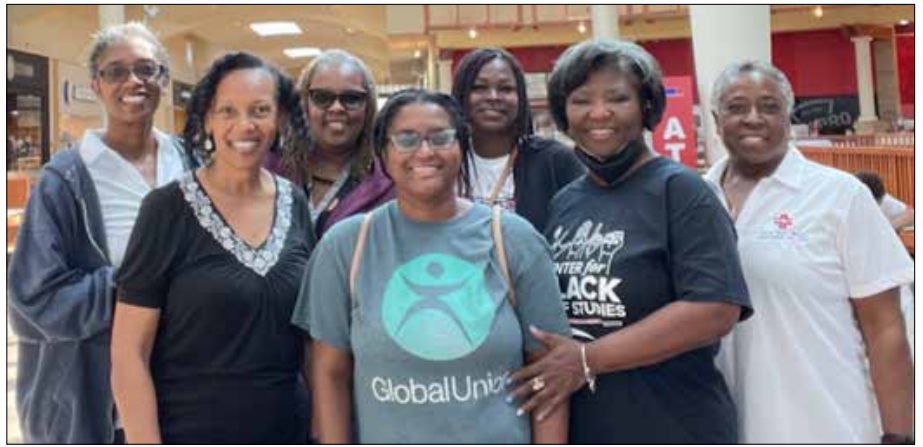
Akron Black Nurses Association